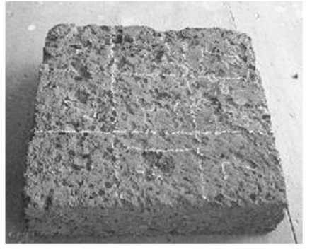
Figure 1. Squared sample of canga.